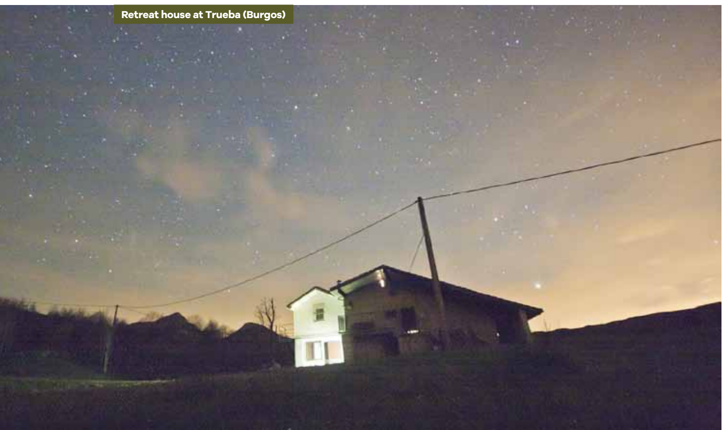
Retreat house at Trueba (Burgos)

The Trueba Cabin , located in the Estacas de Trueba Port, native of Burgos, centers its activity mainly in summer, so the number of people who have made use of it has been about 363 over 45 days.