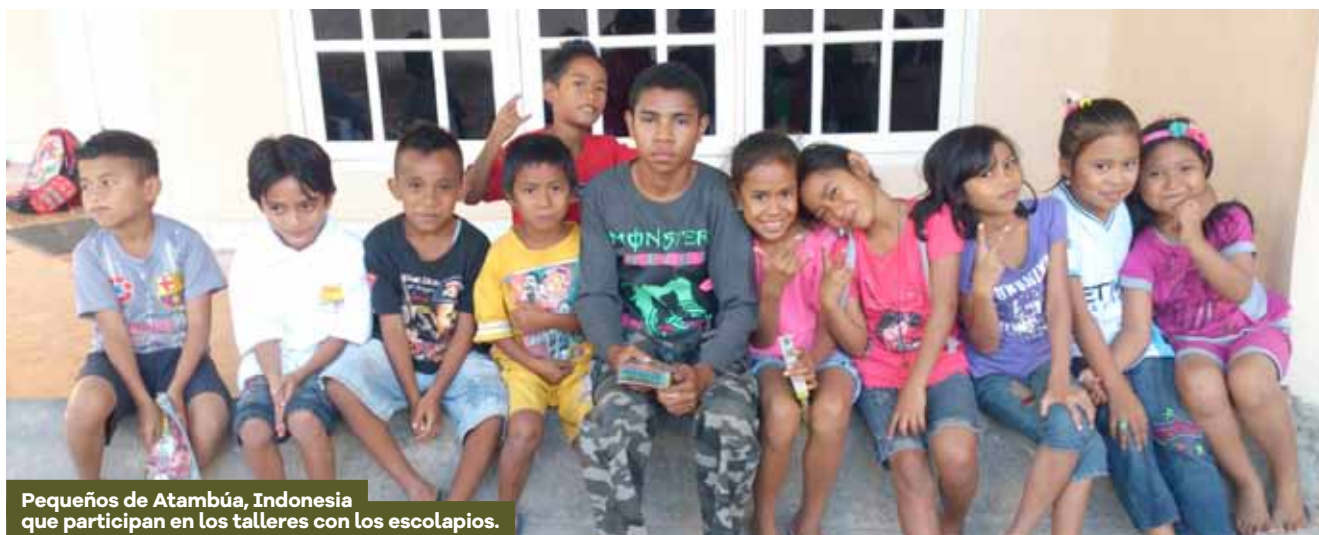
Pequeños de Atambúa, Indonesia que participan en los talleres con los escolapios.

Mexico, Equatorial Guinea, Dominican Republic and Venezuela.