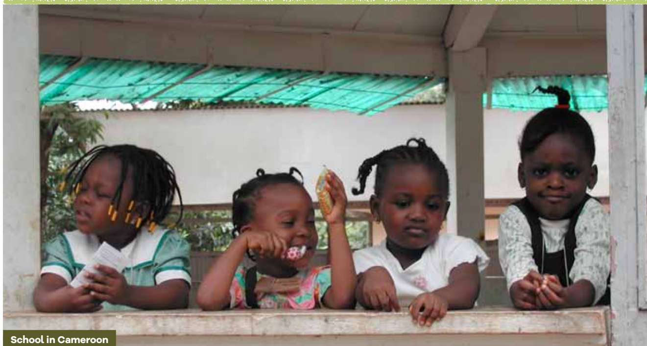
School in Cameroon