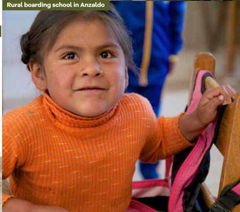
Rural boarding school in Anzaldo