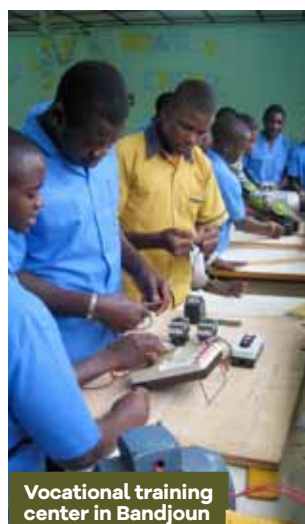
Vocational training center in Bandjoun

In Cameroon there are 2 Itaka-Escolapios' vocational training centers that, attended by about 50 teachers, train in branches of mechanics, electricity, electronics, metal construction, accounting, administration and farming techniques to a total of 524 students , with support from the Government of Cameroon.