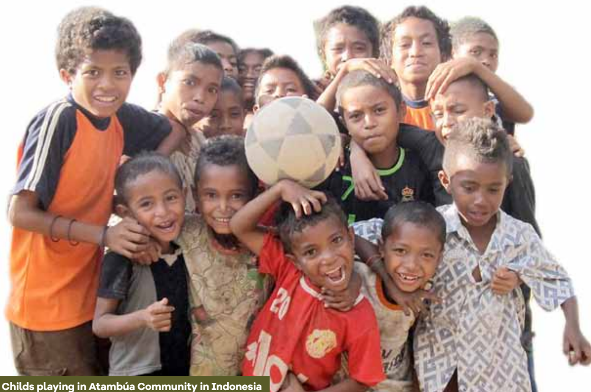
Childs playing in Atambúa Community in Indonesia

There are many challenges. Start the ashram, making it a sustainable project, start a second study community in Yogyakarta, consolidate the non-formal education project "Learning with Calasanz, increase the number of students and improve the conditions in which we teach the classes (to date they take place in tents on the esplanade we have near the Atambúa community.)