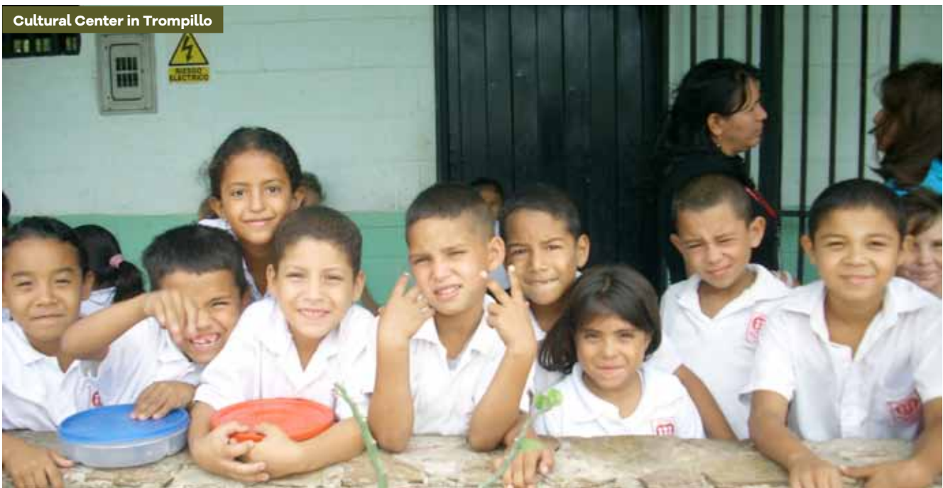
Cultural Center in Trompillo

Finally, around 100 children have participated at the Trompillo Cultural Center , outside the Calasanz Movement, in the school reinforcement classes and in the education in values and "EducArte" projects (drawing, painting and dance) .