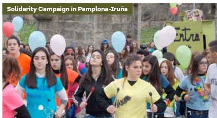
Solidarity Campaign in Pamplona-Iruña