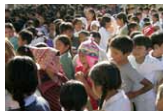
Frontpage photo: rural boarding school in Anzaldo (Bolivia)