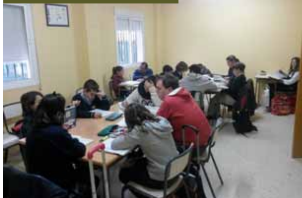
School reinforcement in Seville