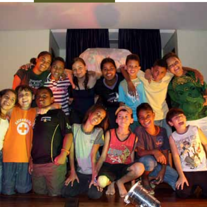
Socio-educational Center in Belo Horizonte (Brazil)

The assessment of the course has been very good on the part of all the implied agents; students, families and the educational team.