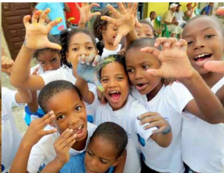
Socio-educational Centers in Governador Valadares (Brazil) and La Puya (Dominican Republic)