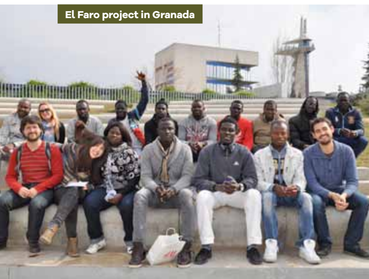
El Faro project in Granada

This work has been possible thanks to the dedication and selfless work of 113 volunteers .