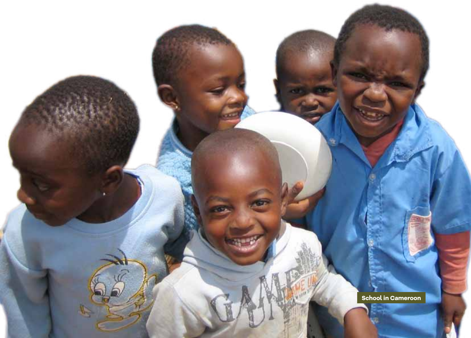
School in Cameroon

We have almost achieved 160.000€ more aid to meet some of the needs that come to us from other countries with an extraordinary nature, but we continue with the challenge, always on the lookout, to add more funds to be able to attend all of them.