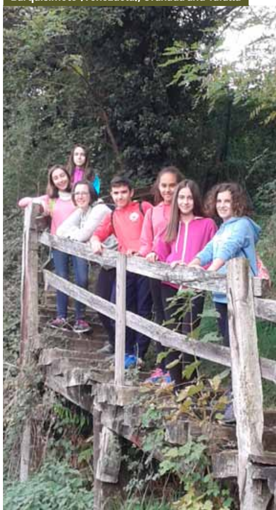
From left to right Calasanz Movement in Barquisimeto (Venezuela), Granada and Tafalla

The reality of the Calasanz Movement in each of these locations is very different. It is worth noting that some of them have recently begun (Barbastro, Jaca and Soria) and in others, the groups that already existed have been integrated into Itaka-Escolapios (Alcañiz, Logroño, Tafalla and Zaragoza). 35% of the students in the Piarist schools that is summoned to participate in the Calasanz Movement have been part of the groups this year. It has been a year of clear progress in the Calasanz Movement, among which the following should be noted: