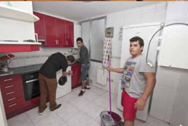
Aukera residential care in Bilbao