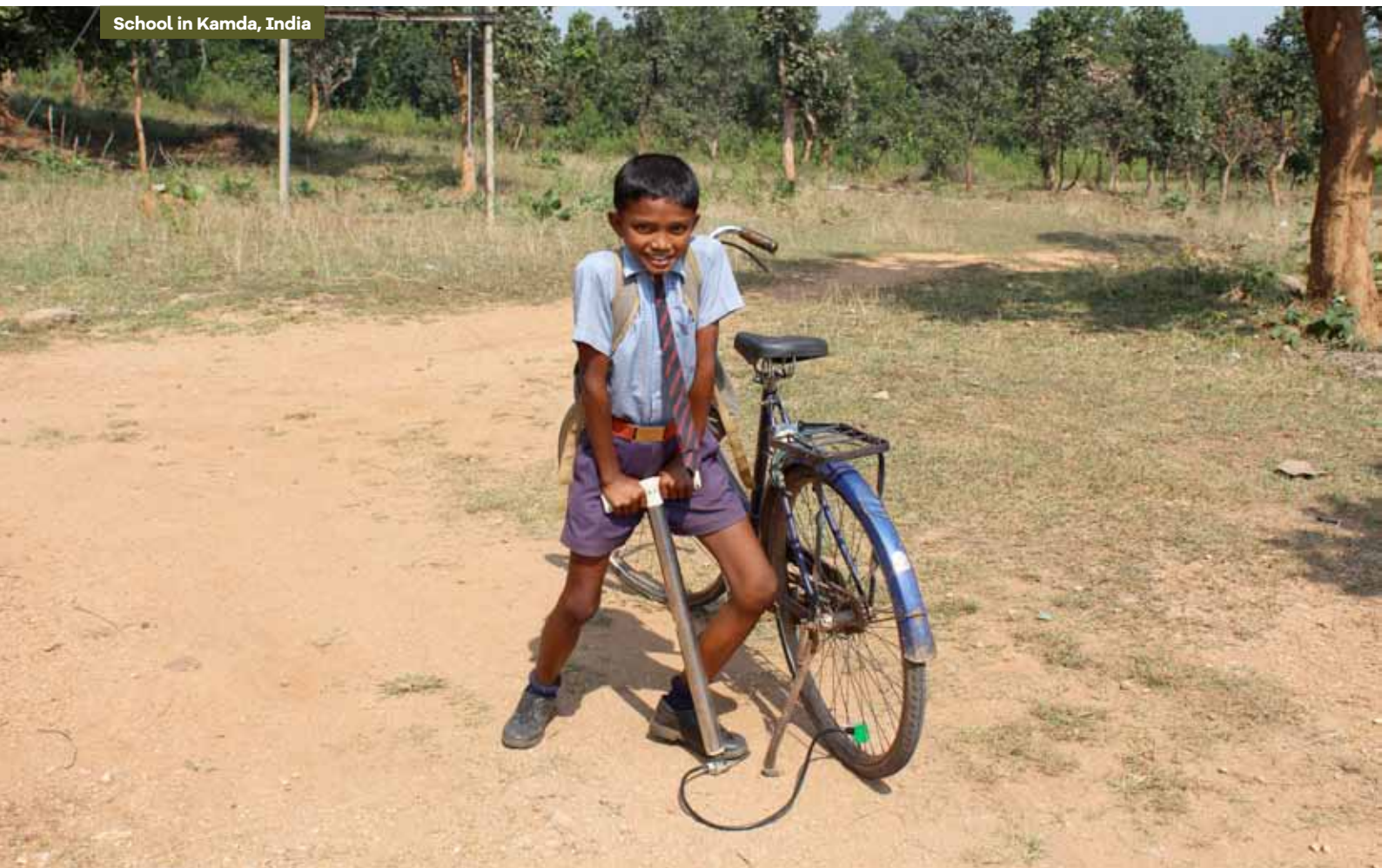
School in Kamda, India