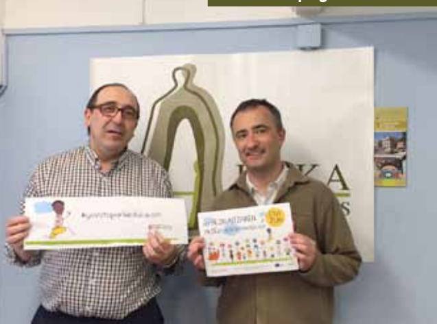
Global Campaign for Education