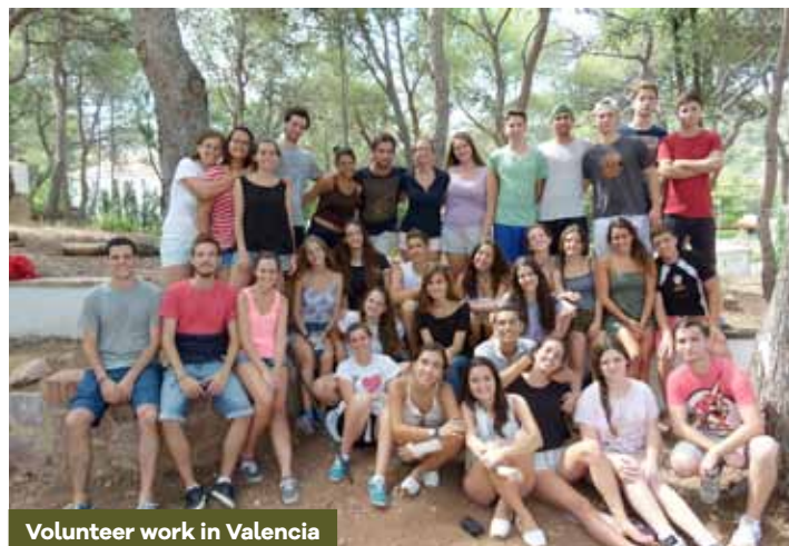
Volunteer work in Valencia

The volunteer work camps that are carried out in our offices in Emmaus and Bethany should be noted in this section. Labor camps of volunteers were held in July 2014 at our offices in Bilbao, Pamplona, Madrid, Valencia and Vitoria involving 104 young people doing volunteer work in organizations that work in the social sector of the 5 cities.