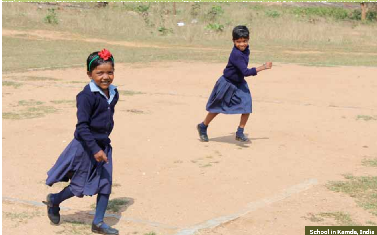
School in Kamda, India